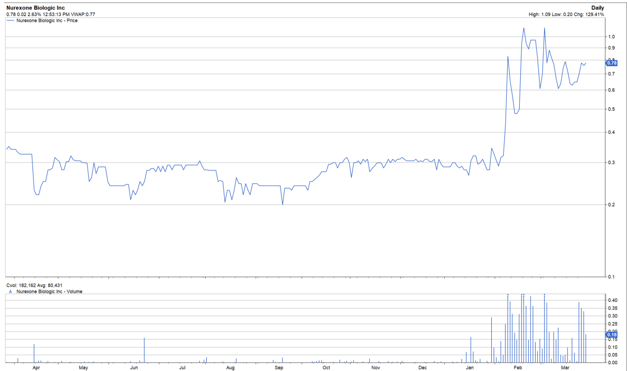
Figure 1 – NurExone Biologic Inc. - Trading snapshot (CAD$)